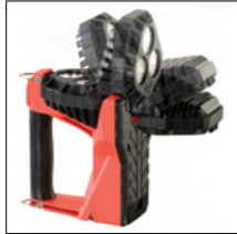
180° articulating head