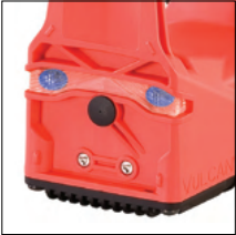
Taillight LEDs ensure you can be seen from behind