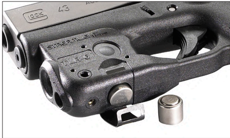
Replace batteries while light remains mounted on gun