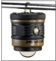
Hangs with spring-loaded D-ring, which stows against the body when not in use