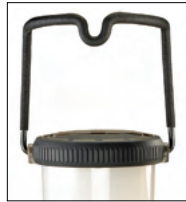
Ergonomic handle designed to lock in upright or stowed position