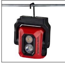
Stowable hang hook