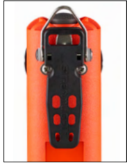
Spring-loaded clip with built in D-ring

CLASS I, DIVISION 1 RATED RIGHT-ANGLE FLASHLIGHT