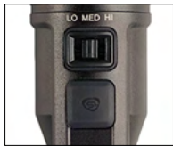
High, Medium, or Low Mode Switch