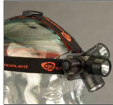
90° tilting head