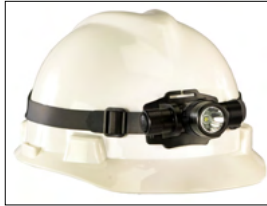
Rubber strap firmly stays in place on hard hats