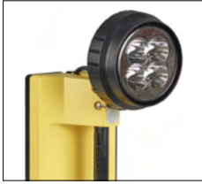
Head rotates to aim the beam