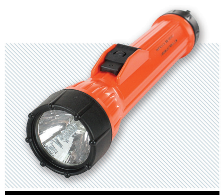
Larson Electronics LE-224