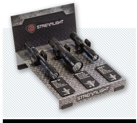
Streamlight ProTac Counter Display