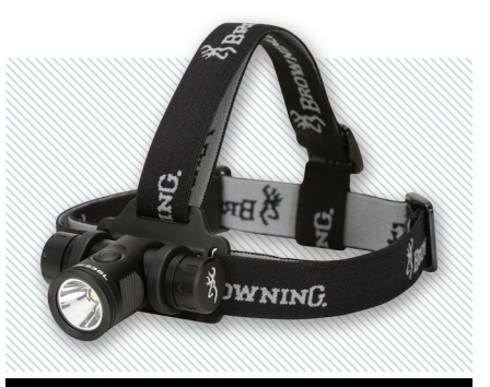
Browning Black Out 6V Head Lamp

Countertop displays, such as this Streamlight unit, allow customers to handle flashlights for size, tactile feel, brightness and functions — which can make all the difference in garnering a sale.